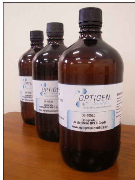
Optigrade™ HPLC grade acetonitrile is currently available in 2.5l or 4.0l Winchester

A point in case is acetonitrile for HPLC. With the global shortage of this product we have worked hard to ensure that we continue to supply your needs with our highly sought-after stock of Optigrade™ acetonitrile for HPLC from our stores in Adelaide, South Australia.